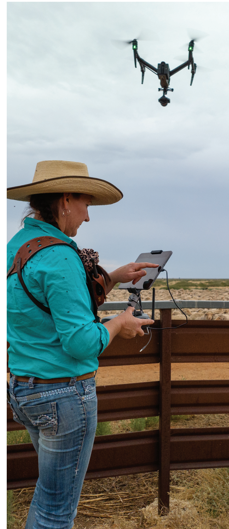
Revolutionising farm management