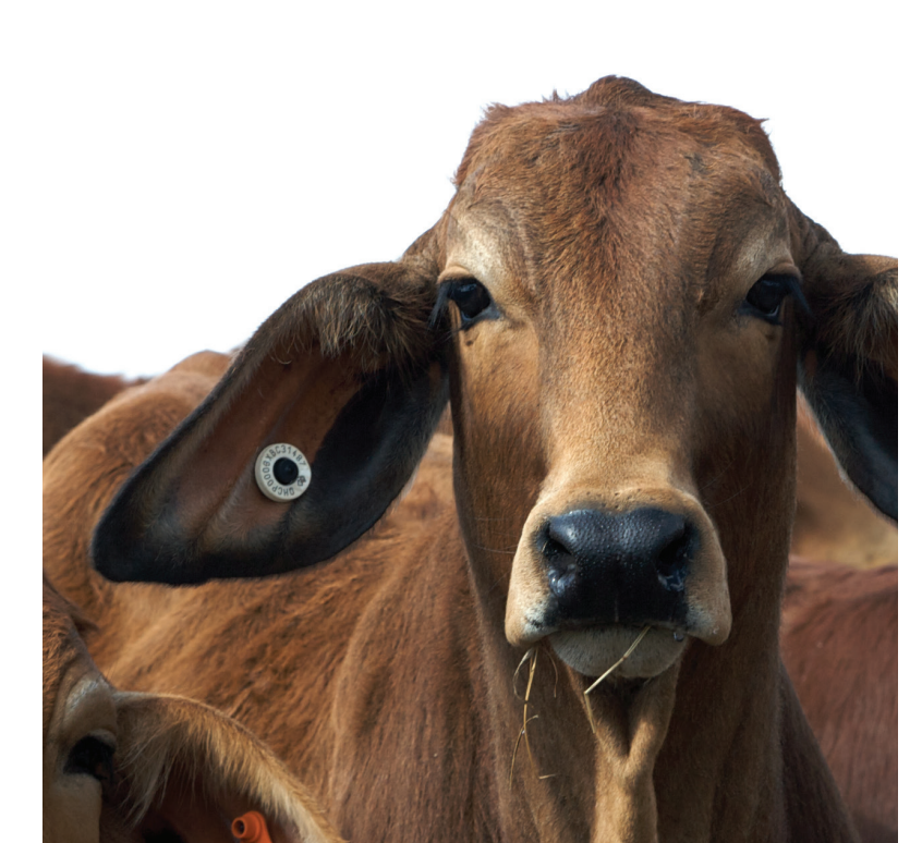
Advancements in food safety and traceability