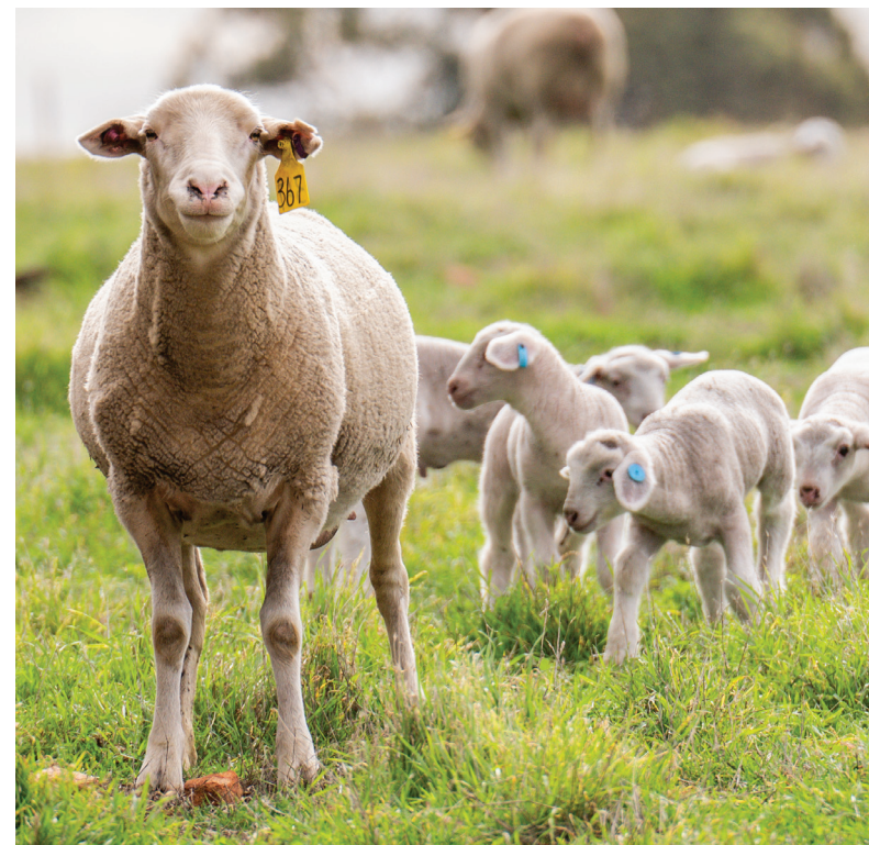
Investment in livestock genetics R&D