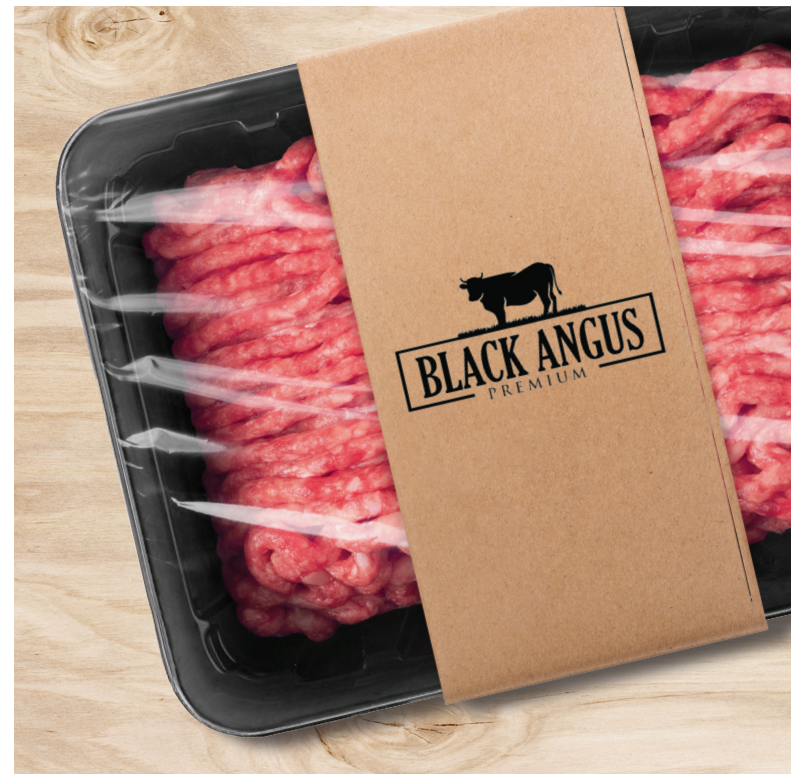
Advanced packing and processing

Technology and innovation are critical enablers to ensure the future sustainability of the Australian red meat and livestock industry. Research and development (R&D) is a large industry focus, supporting continuous improvement through best practice and innovative technology and tools.