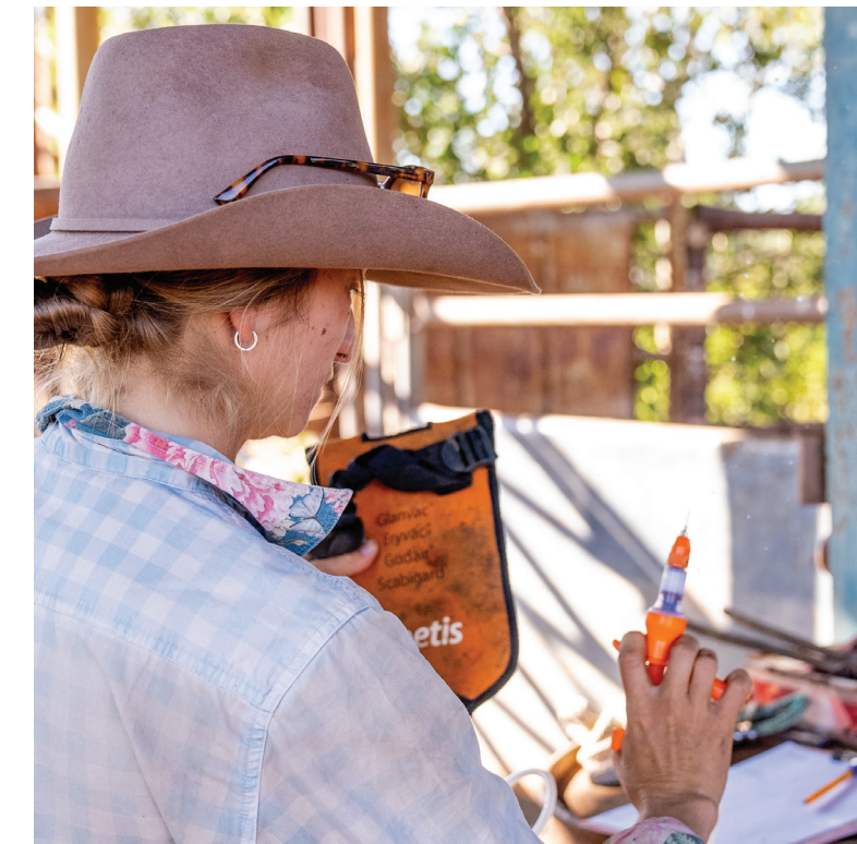
Improved health and welfare practices