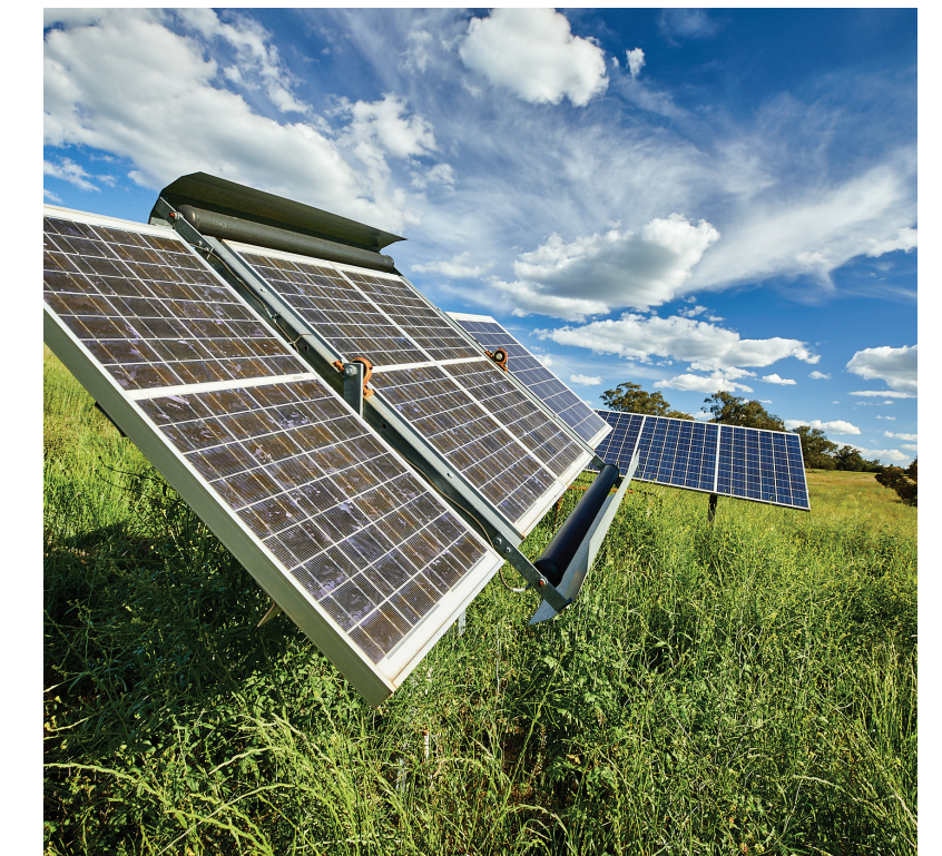
Developing energy-saving technologies