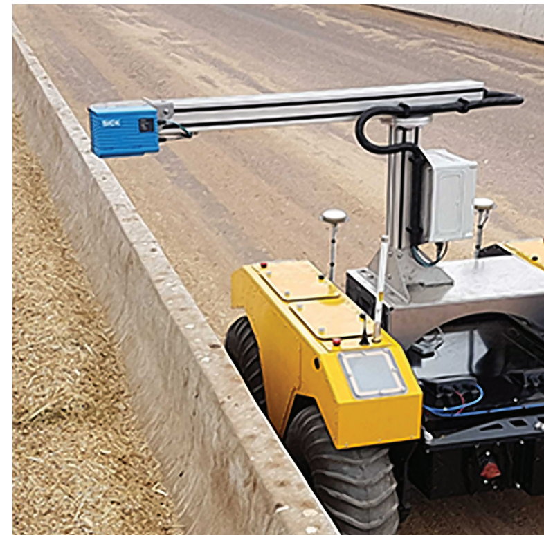
Innovative automated feed management